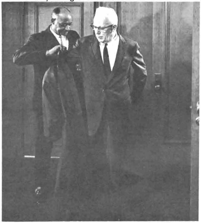
Earl Warren, the Great Desegregator

The twenty had grown to more than half a million