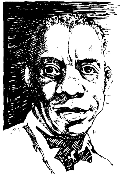
It was Baldwin who wrote in No Name in the Street (Dial Press, 1972, pp. 191-192):

Like bread cast upon the waters, they are coming back—Huey Newton, Eldridge Cleaver and now James Baldwin.